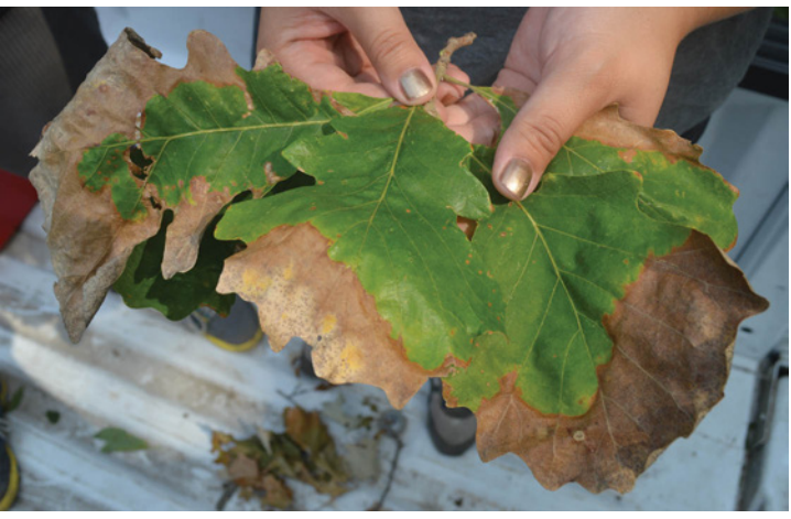
Figure 1.—Top: Red oak leaves with oak wilt symptoms.

Middle: Bur oak leaves with oak wilt symptoms.