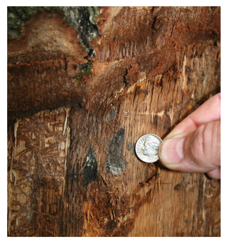
Figure 3.—Spore mat produced by the oak wilt fungus ( Ceratocystis fagacearum ) in a dead red oak.

Pokorny, Jill. 1999. How to collect field samples and identify the oak wilt fungus in the laboratory. NA–FR–01–99. Radnor, PA: U.S. Department of Agriculture, Forest Service, Northern Area State and Private Forestry. https://www.na.fs.fed.us/spfo/pubs/howtos/ht_oaklab/info.htm. (12 July 2017)