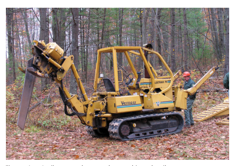
Figure 4.—A vibratory plow can be used in oak wilt management to disrupt root grafts and stop the fungus from spreading from infected trees to healthy trees.