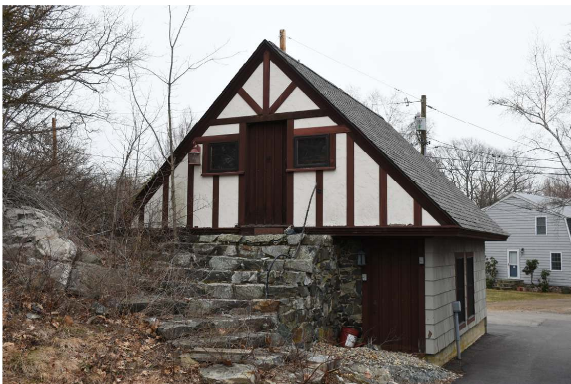
Photo 77) 38 Laurel Lane – Garage/Storage Reference (file name): PIC_9545