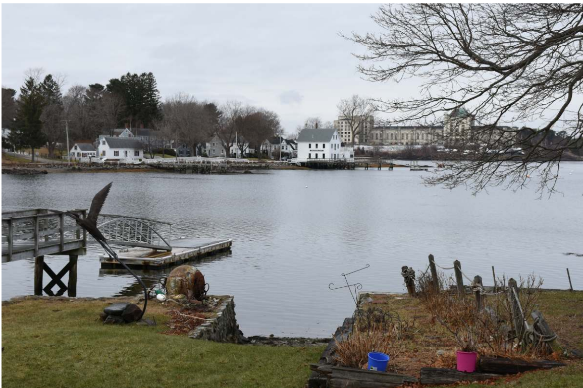
Photo 29) View of Cape Road and Piscataqua Café across water from Shore Lane Reference (file name): PIC_5250