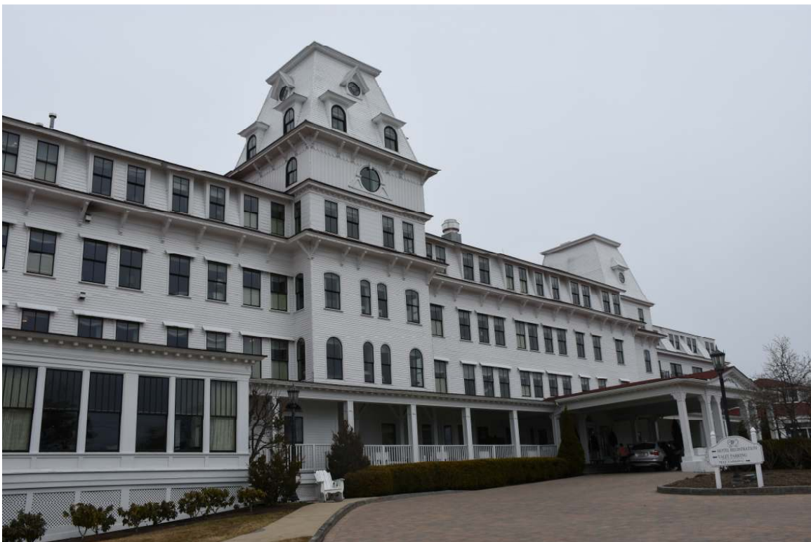
Photo 282) 588 Wentworth Road, Wentworth Hotel Reference (file name): PIC_9590