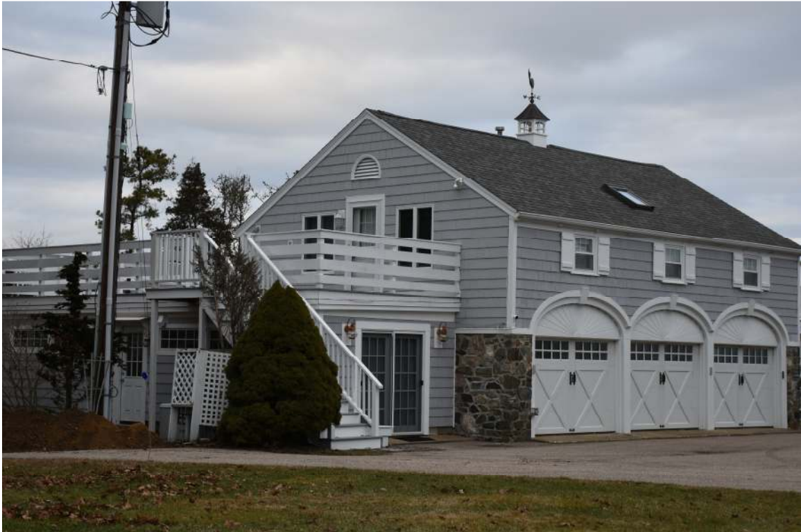
Photo 290) 149 Wild Rose Lane garage Reference (file name): PIC_5623