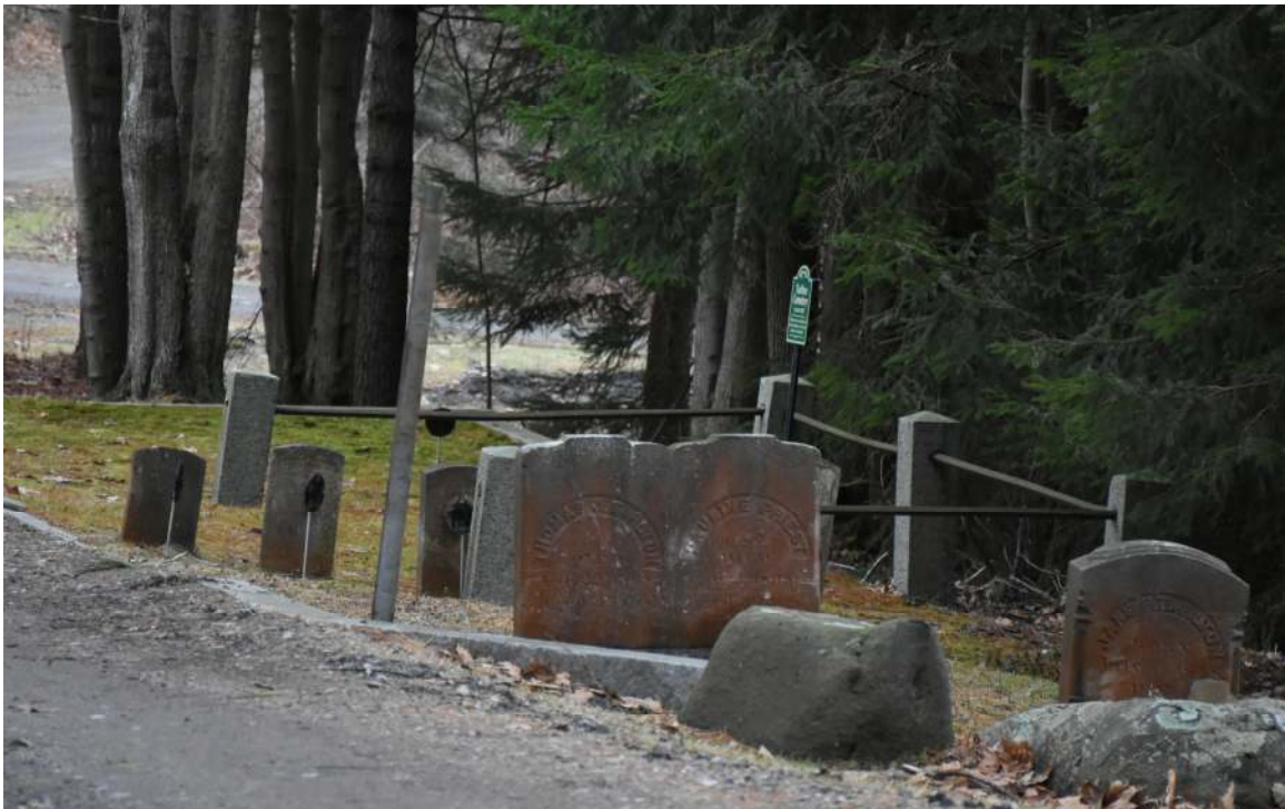
Photo 169) Tarleton Cemetery, Pit Lane Reference (file name): PIC_5534