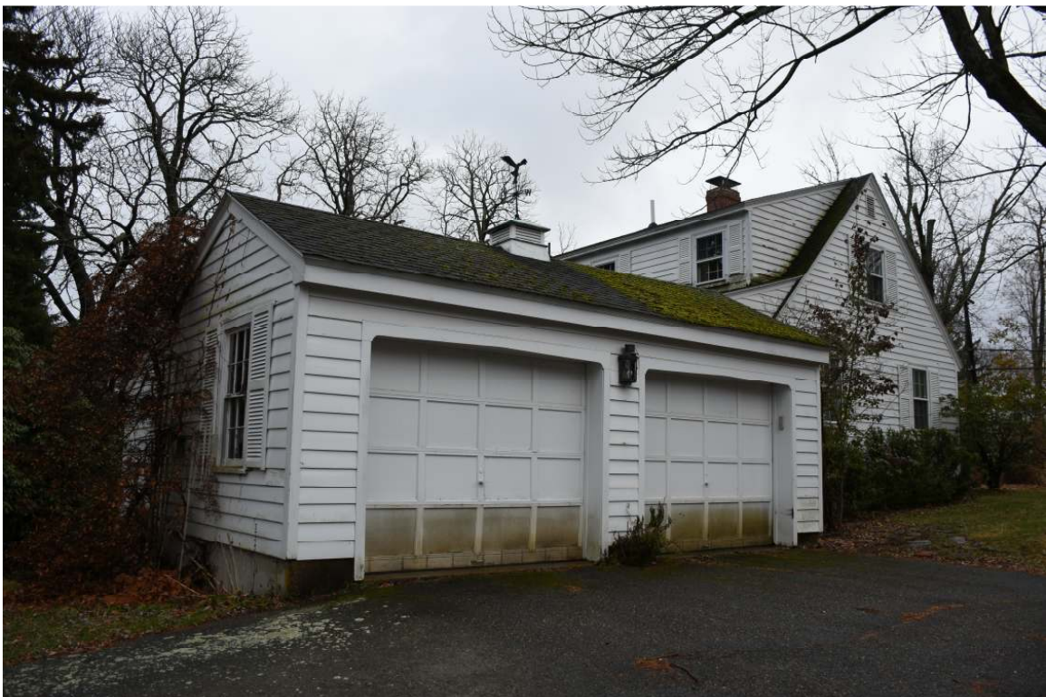
Photo 183) 134 Portsmouth Avenue – Garage Reference (file name): PIC_4701