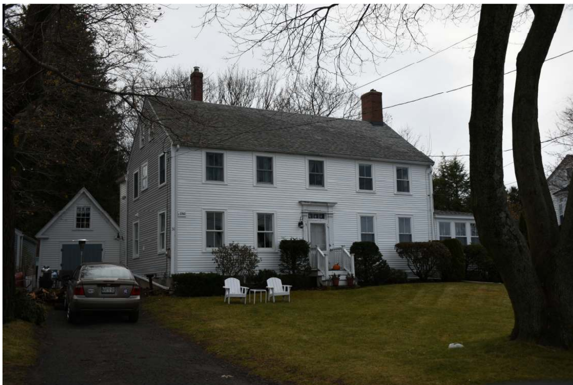
Photo 26) 31-33 Cape Road Reference (file name): PIC_4782