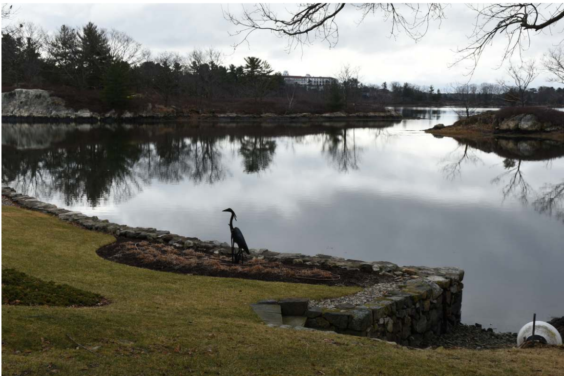
Photo 83) View south from south end of Laurel Lane with stone retain wall towards Birch Island (right) and Long Rock/Mill Island (left) with Hotel Wentworth in background Reference (file name): PIC_5291