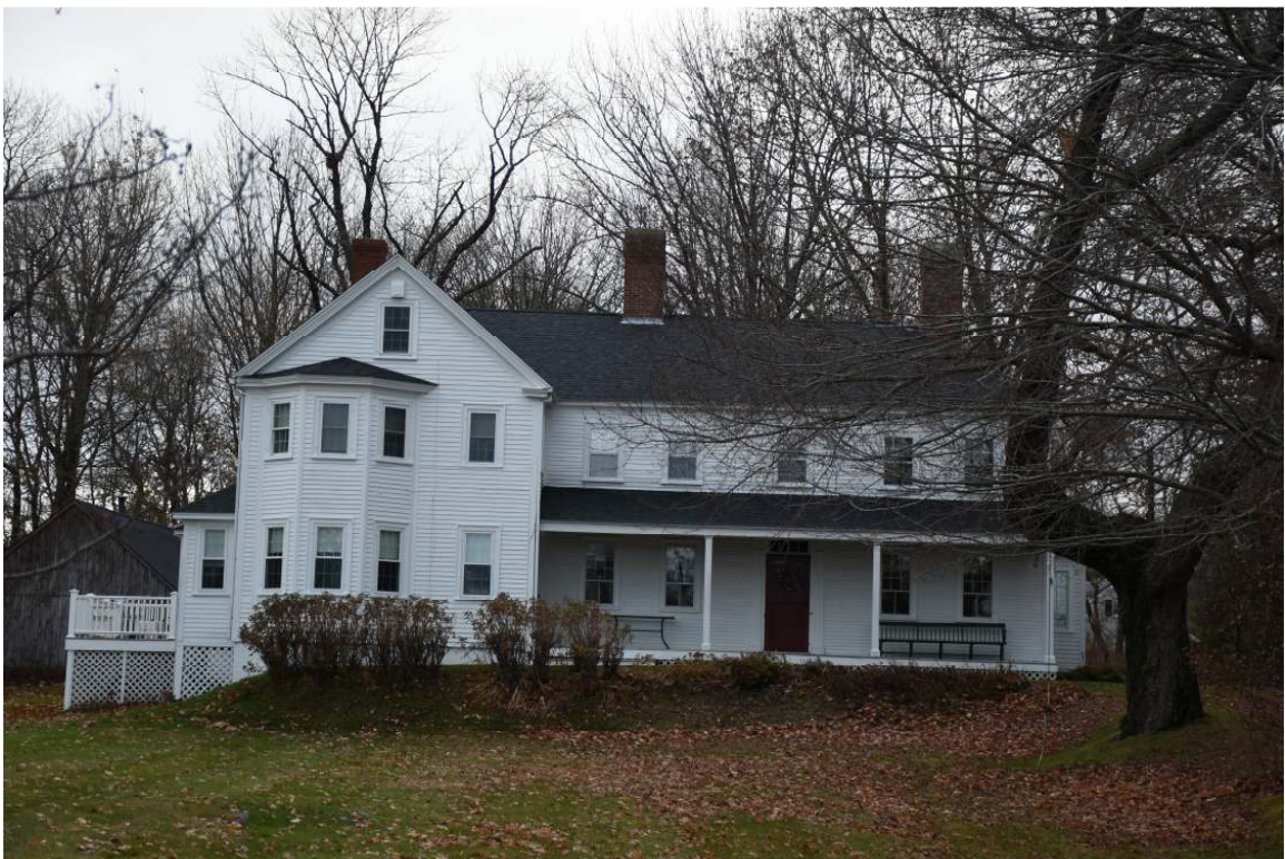
Photo 144) 56A (left) and 56 (right) Oliver Street Reference (file name): PIC_4775