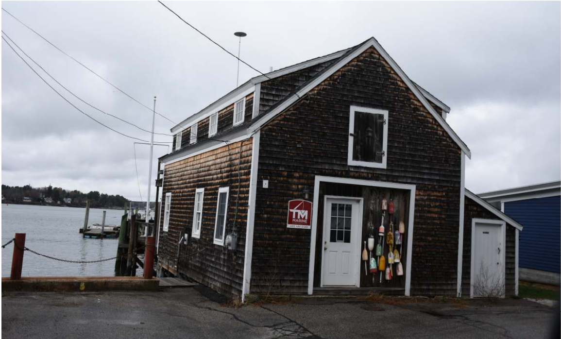
Photo 219) 1 Steamboat Lane boathouse Reference (file name): PIC_4571