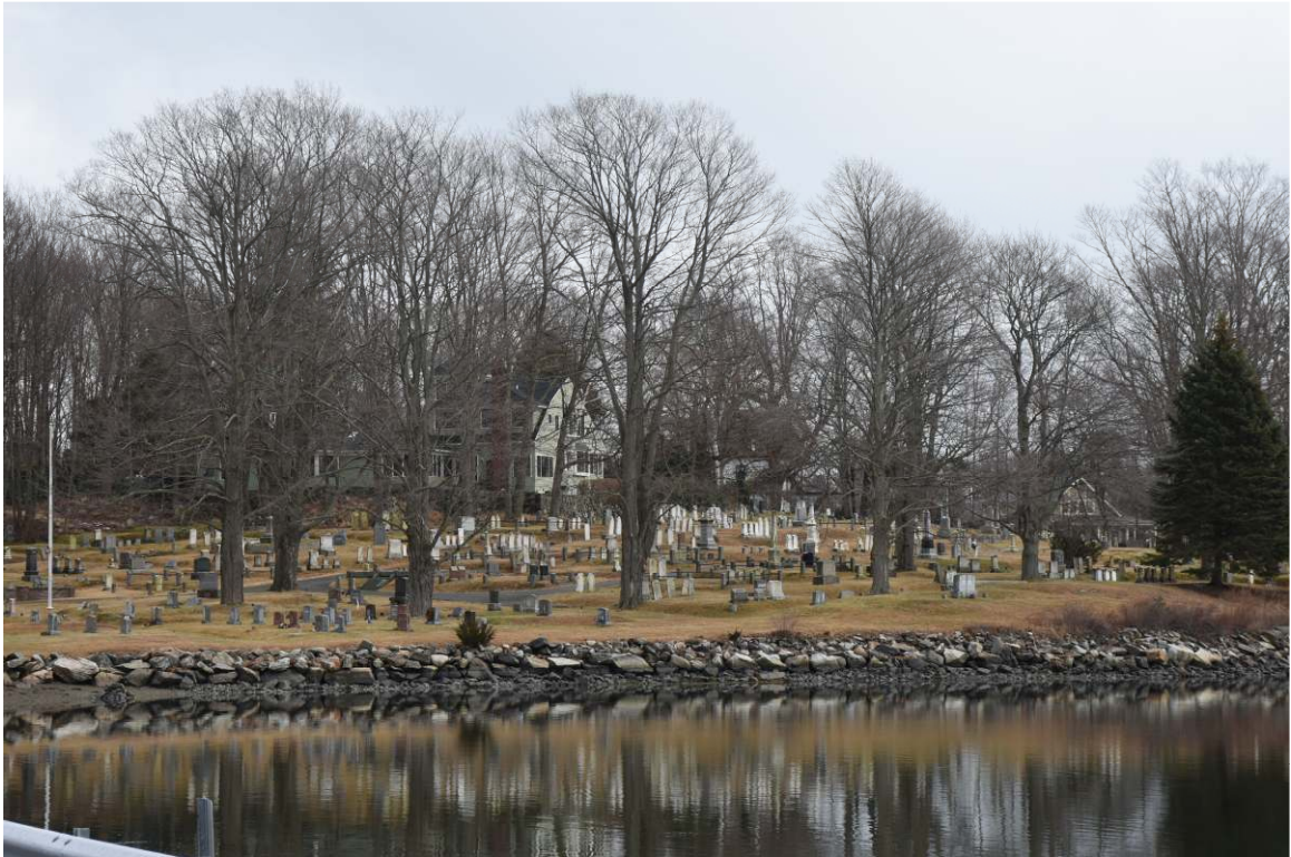
Photo 192) Riverside Cemetery which also shows 183 Portsmouth Avenue Reference (file name): PIC_5260