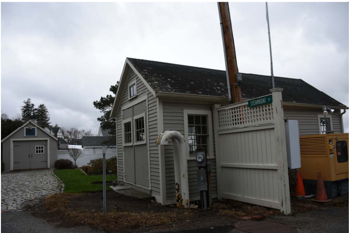
Photo 10) 35 Atkinson Street – Boathouse, Shed Reference (file name): PIC_4572