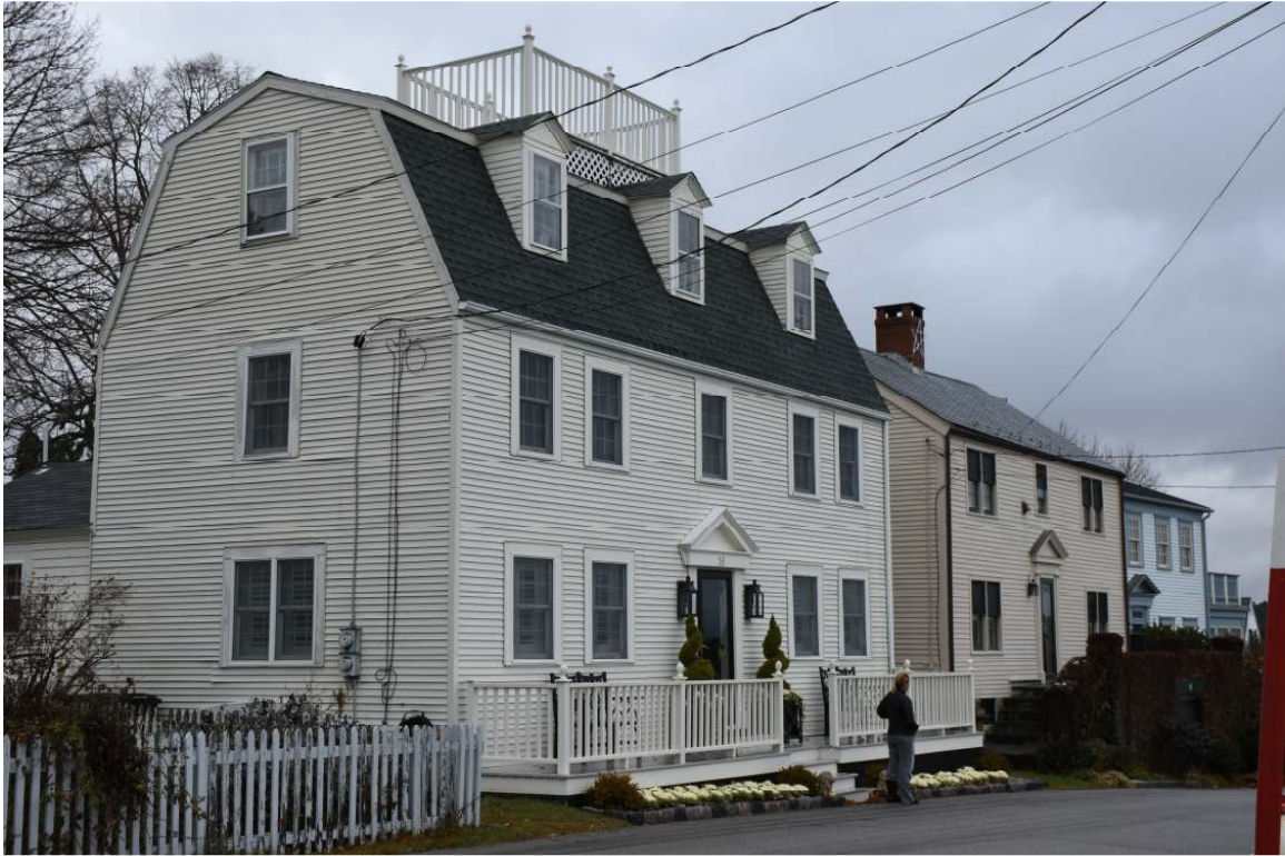
Photo 253) 16 and 12 Wentworth Road Reference (file name): PIC_4428