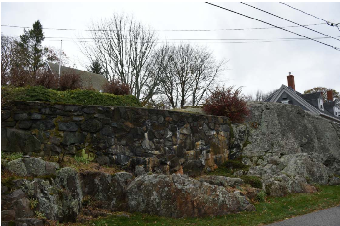
Photo 42) Cranfield Street – Mortared stone wall and ledge Reference (file name): PIC_4475