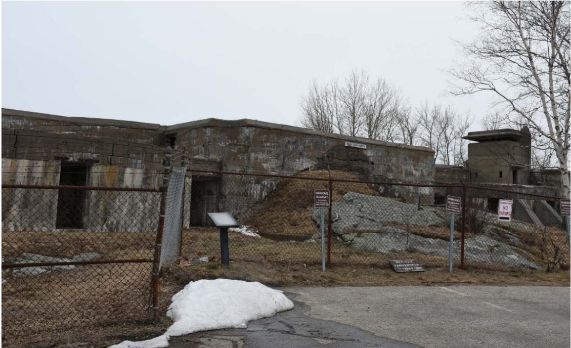
Photo 223) Fort Constitution Battery Elon Farnsworth and Fire Control Tower Reference (file name): PIC_9716