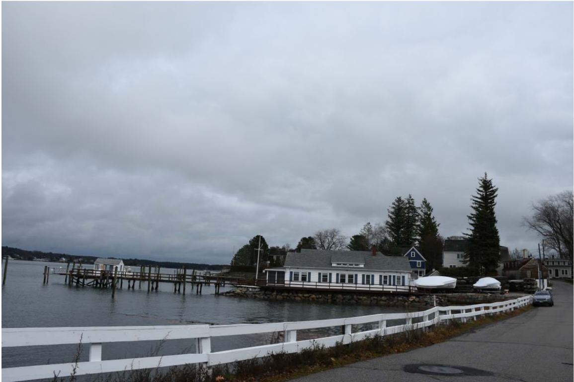
Photo 162) Piscataqua Street Piscataqua Street Wharf under Portsmouth Yacht Club, piers