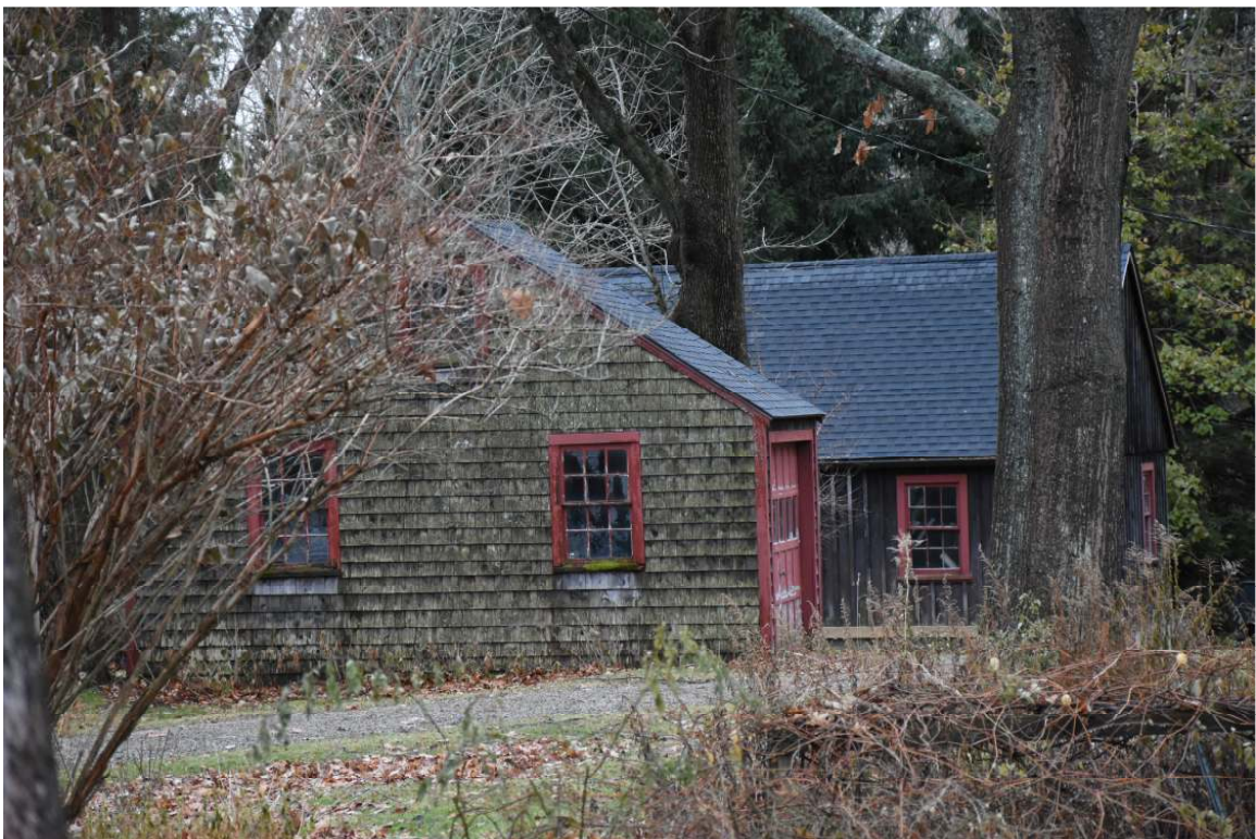
Photo 146) 56 Oliver Street – Garage and Shed Reference (file name): PIC_4732