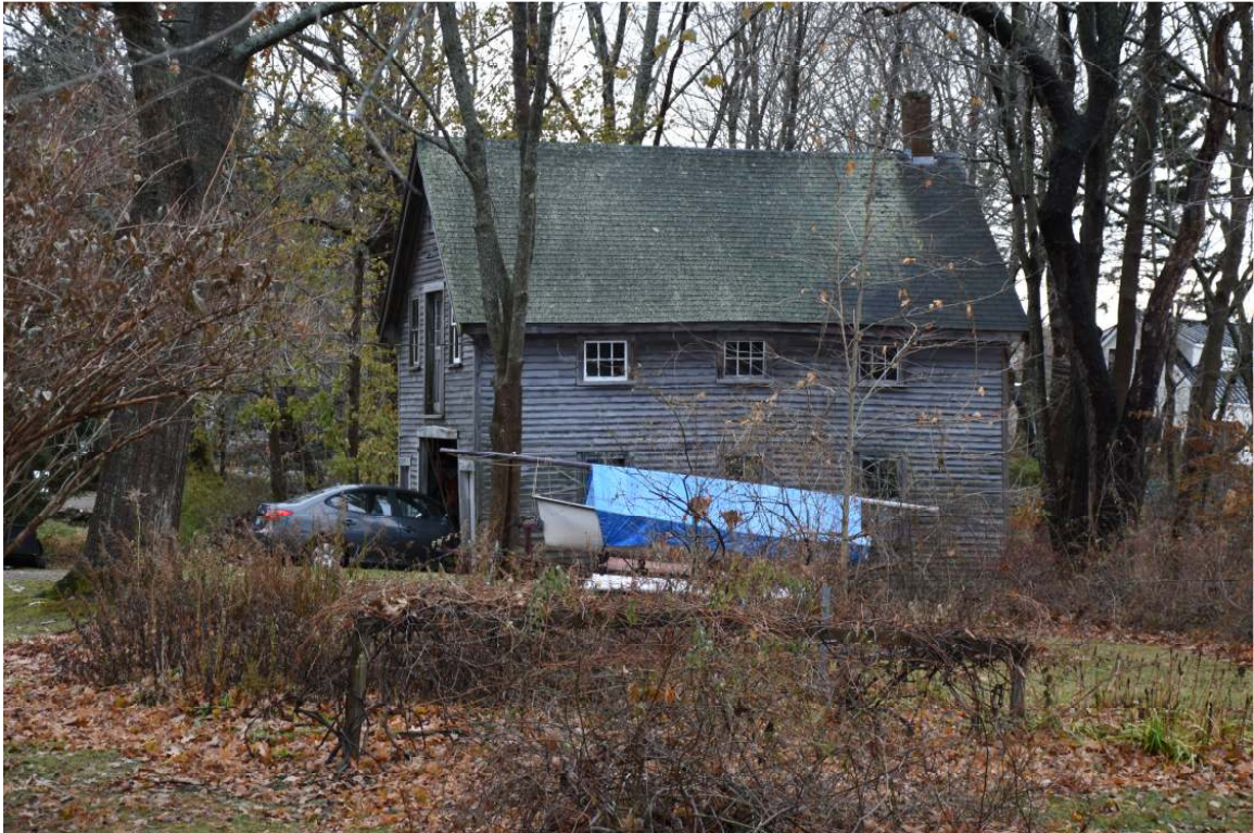
Photo 145) 56 Oliver Street – Barn/Workshop Reference (file name): PIC_4731