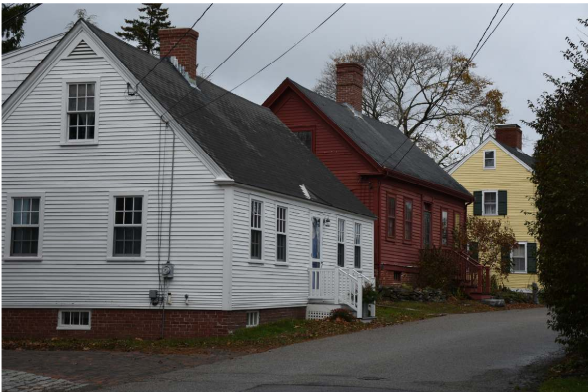
Photo 155) 50 (left) and 46 (right) Piscataqua Street Reference (file name): PIC_4584