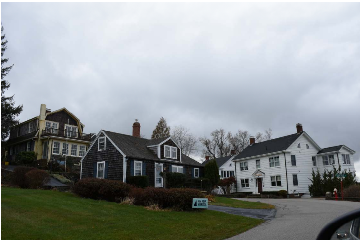
Photo 167) 115 (back) and 117 (front) Piscataqua Street Reference (file name): PIC_4472