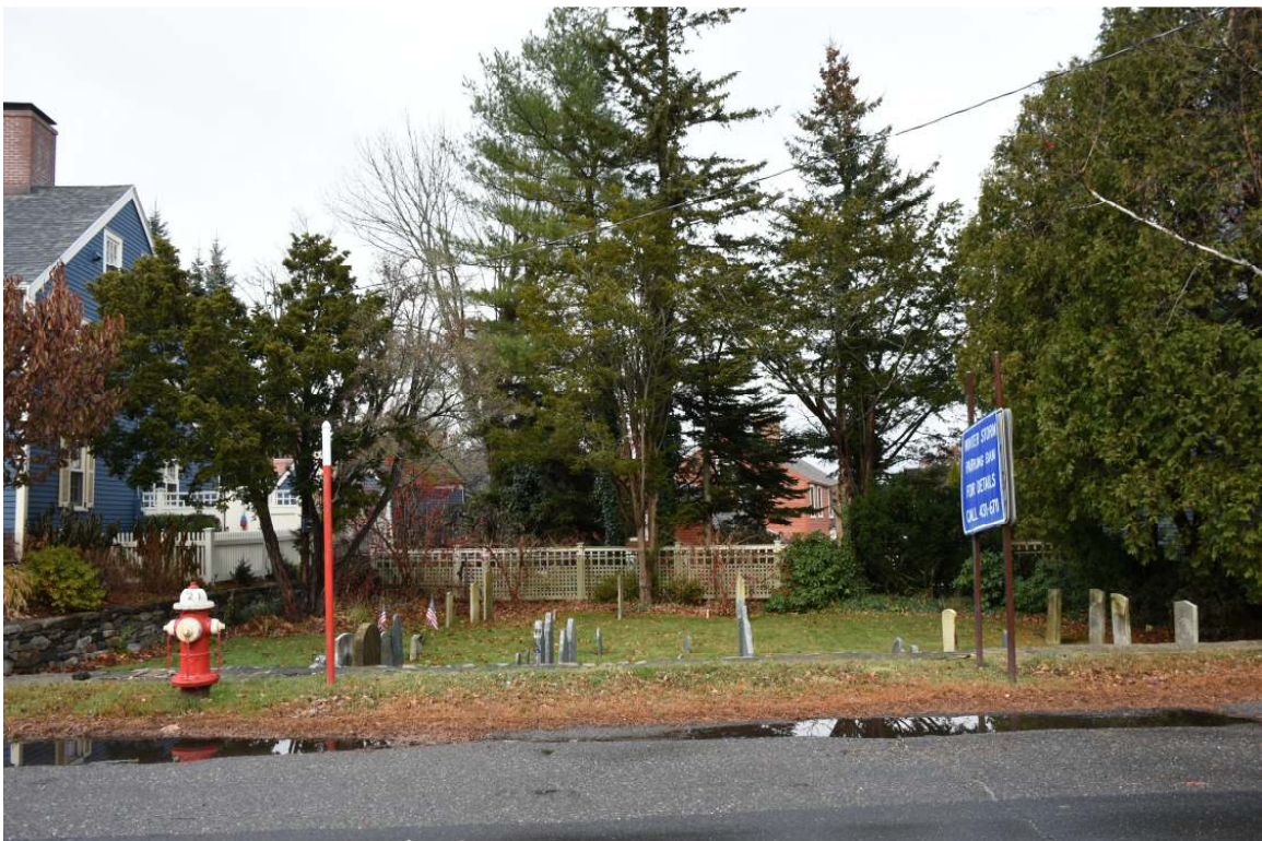
Photo 103) Frost Cemetery, Main Street Reference (file name): PIC_4515