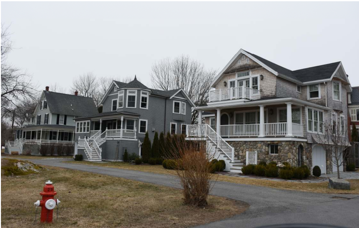
Photo 69) Streetscape of 18, 10, and 4 Fellows Court Reference (file name): PIC_9707