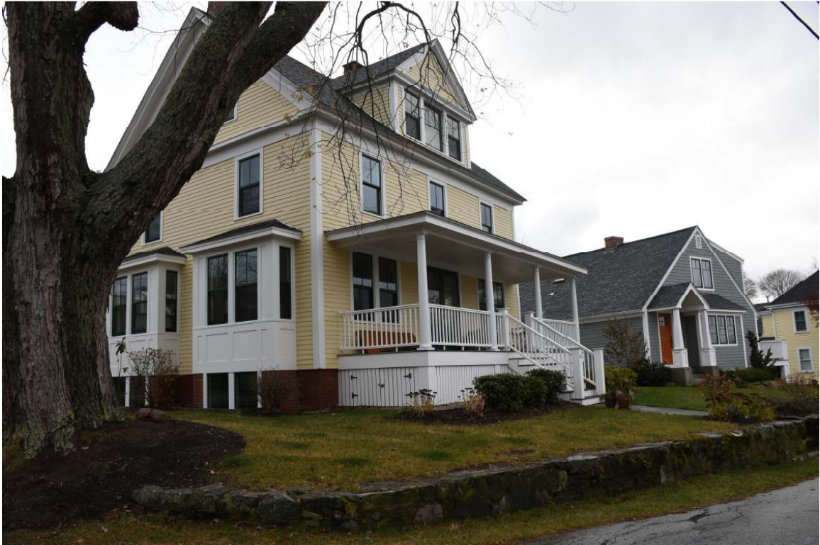
Photo 158) 63 (left) and 69 (right) Piscataqua Street Reference (file name): PIC_4451