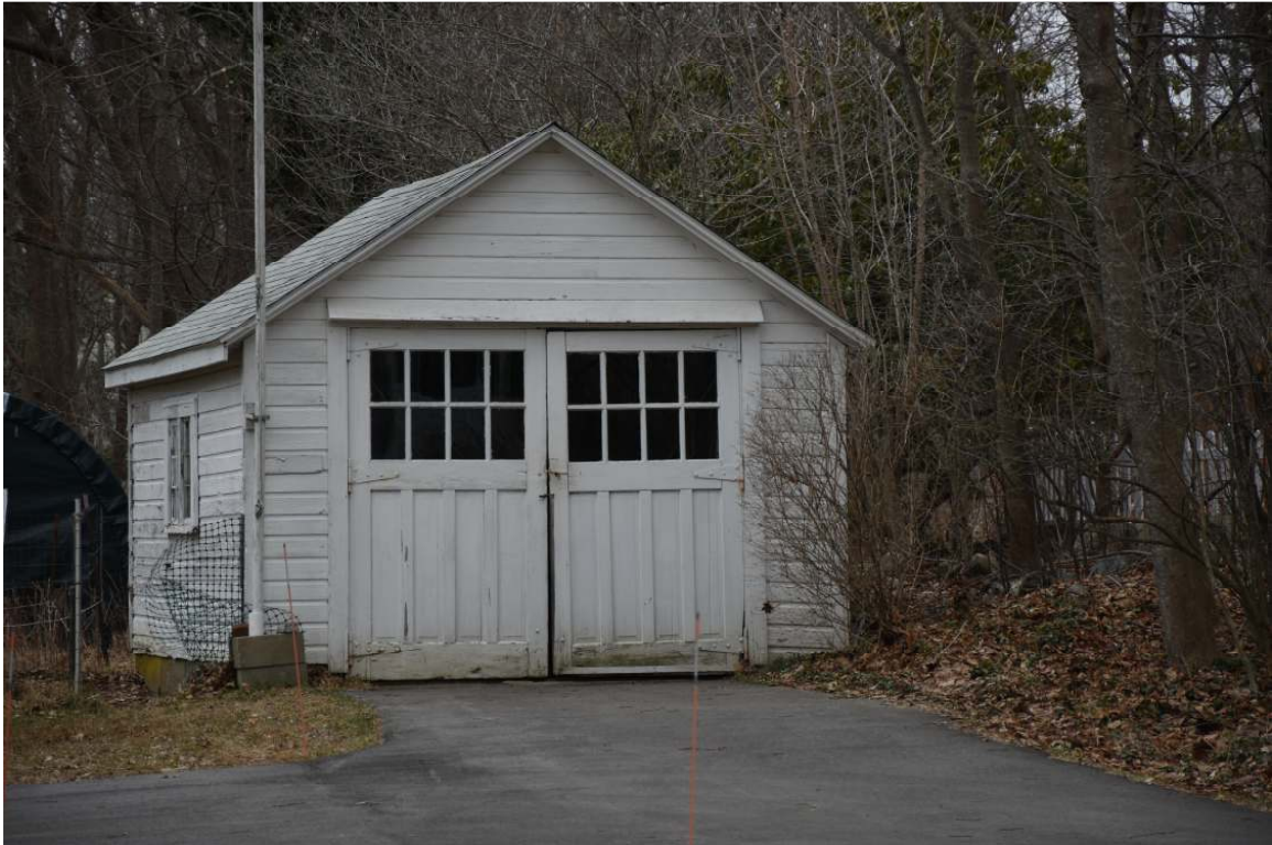
Photo 229) 40 Vennards Court – Garage Reference (file name): PIC_9737