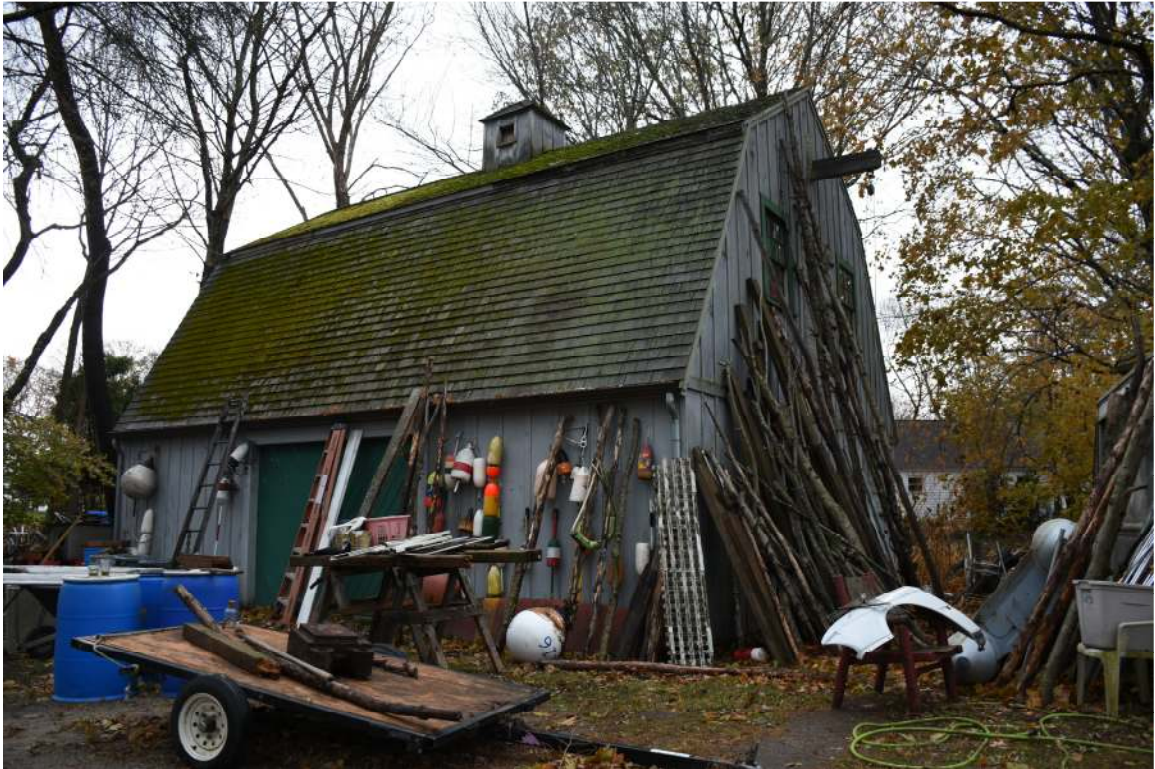
Photo 141) 34 Oliver Street – Barn Reference (file name): PIC_4743