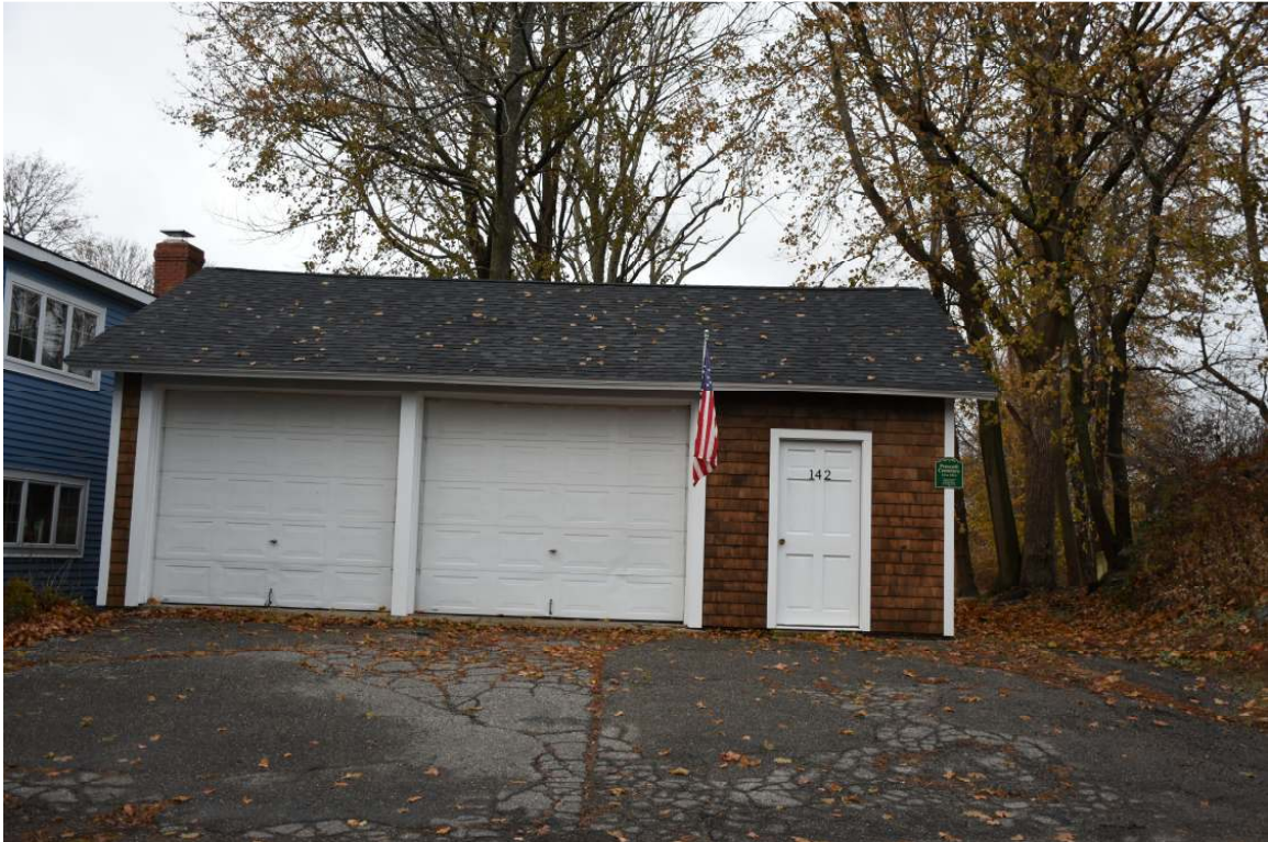
Photo 124) 142 Main Street – Garage at cemetery Reference (file name): PIC_4829