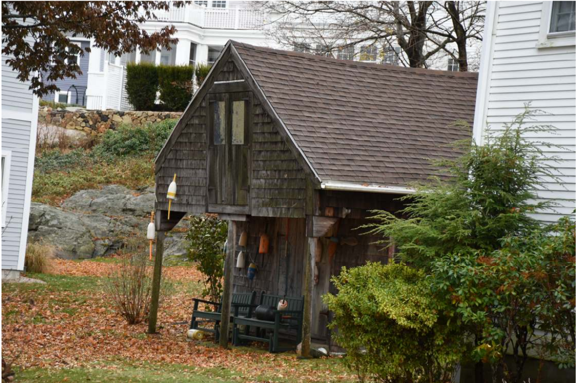
Photo 64) 17 Elm Court – Boathouse Reference (file name): PIC_4466