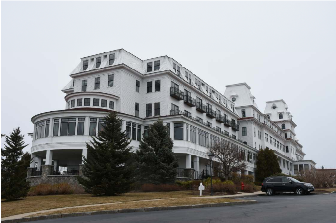
Photo 283) 588 Wentworth Road, Wentworth Hotel Reference (file name): PIC_9597