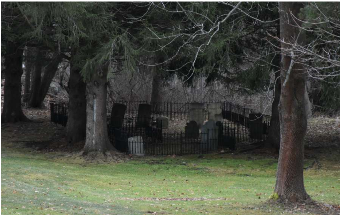
Photo 226) The Vernnard Field Cemetery, 21 Vennards Court Reference (file name): PIC_5509