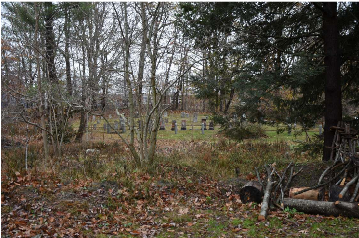
Photo 171) 44 Portsmouth Avenue, Marvin Cemetery Reference (file name): PIC_4738