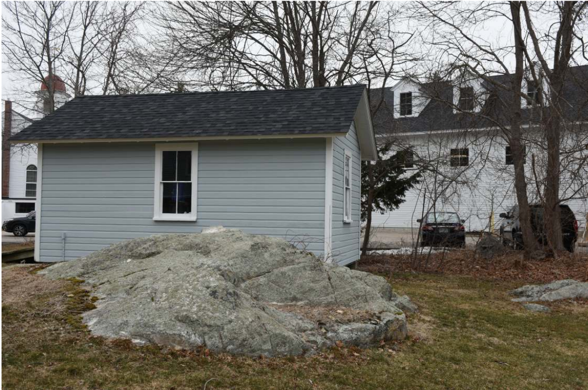
Photo 102) 55 Main Street – Garage Reference (file name): PIC_9589