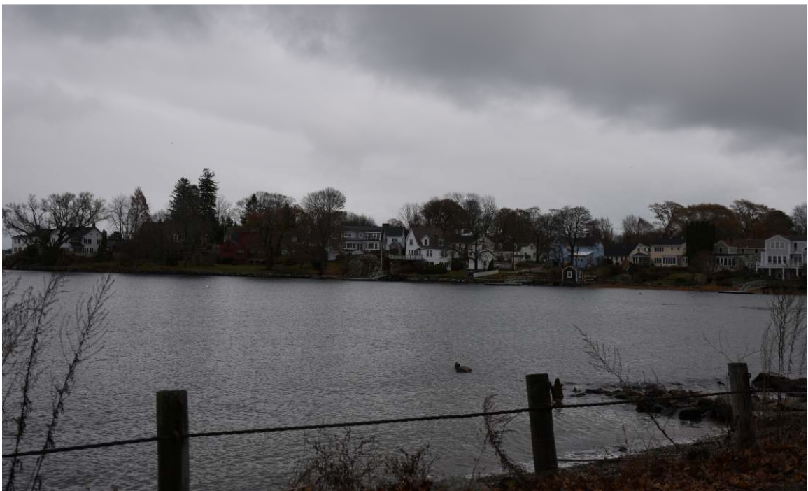
Photo 60) Looking east from Cape Road towards Cranfield Street between Piscataqua Street and River Road, showing rear elevations of houses and retaining walls, docks, and boathouses Reference (file name): PIC_4726