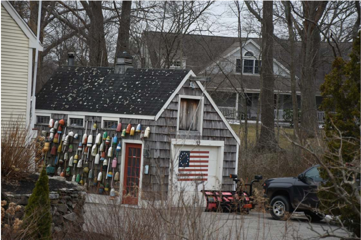
Photo 176) 79 Portsmouth Avenue – Boathouse (associated house is 1986) Reference (file name): PIC_9581