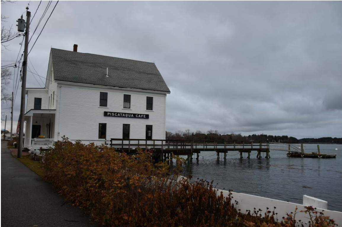
Photo 28) 32 Cape Road, Piscataqua Café Reference (file name): PIC_4800