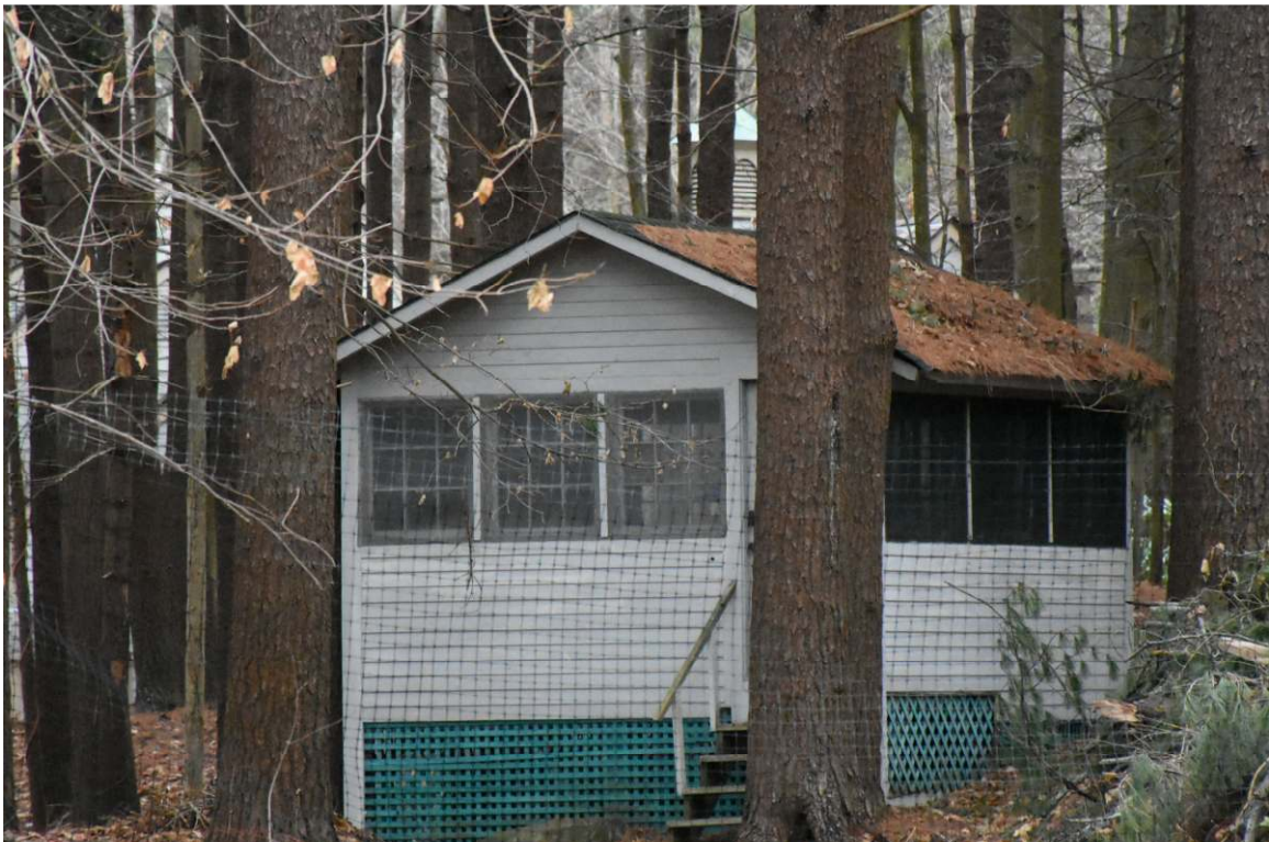
Photo 285) 56 Wild Rose Lane – Cabin (associated house is 1990) Reference (file name): PIC_5654