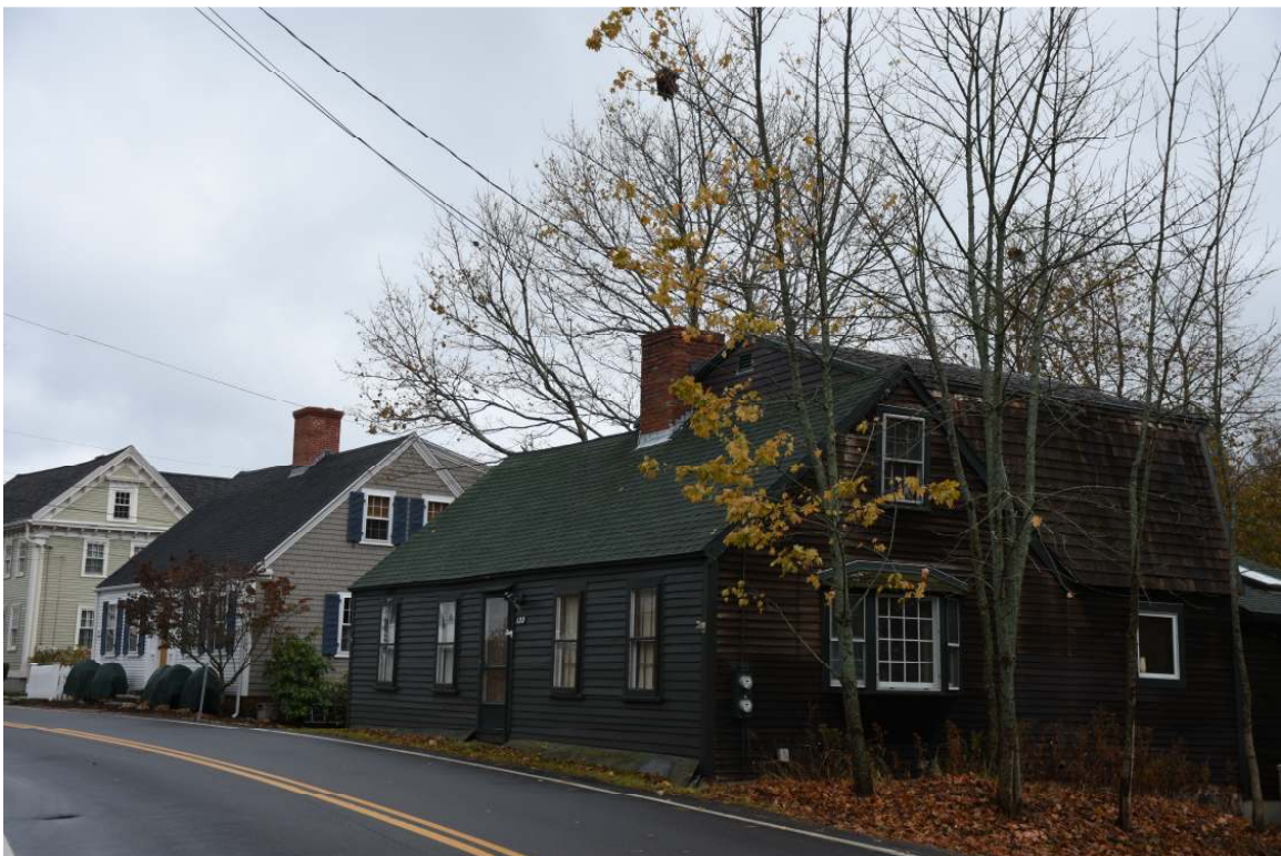
Photo 123) 127 and 133 Main Street Reference (file name): PIC_4599