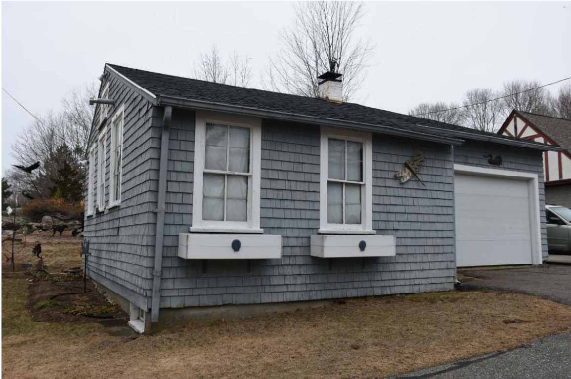
Photo 82) 66 Laurel Lane – Shed/Garage Reference (file name): PIC_9540