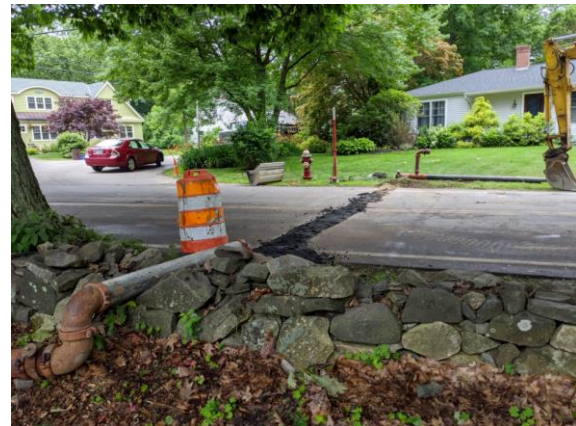
Temporary Water Crossing at M.H. Trefethen School