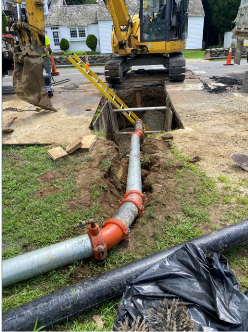
Temporary Water Connection to School