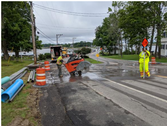
Saw Cutting for Installation of Services