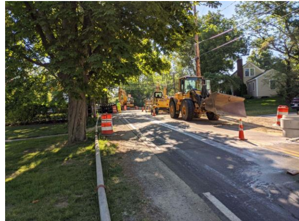
New Water Main Installation