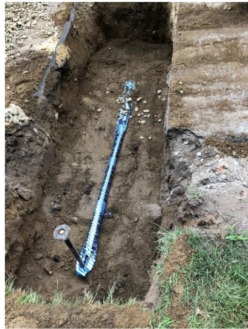
New Service at Riverside Cemetery