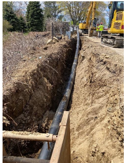
New Water Main Installation