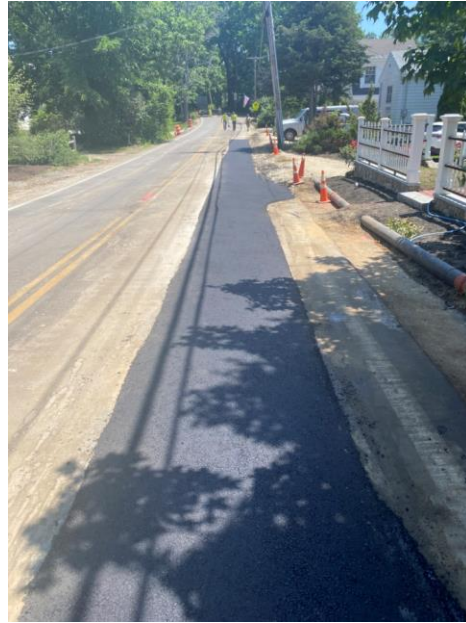
Temporary Trench Patch