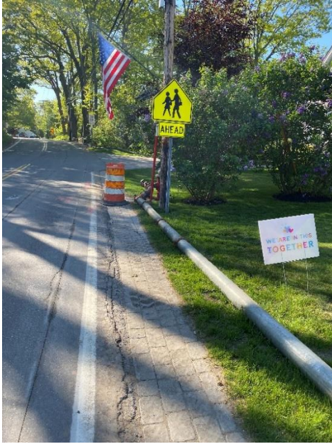
Temporary Water Installation