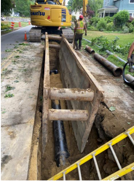
New Water Main Installation