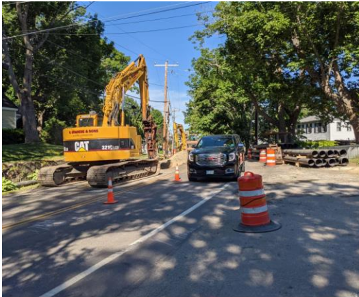
New Water Main Installation