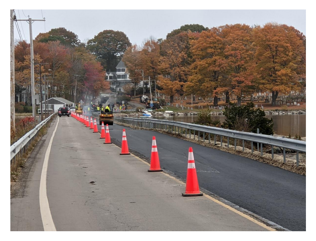
Causeway Binder Course Completed October 21, 2020