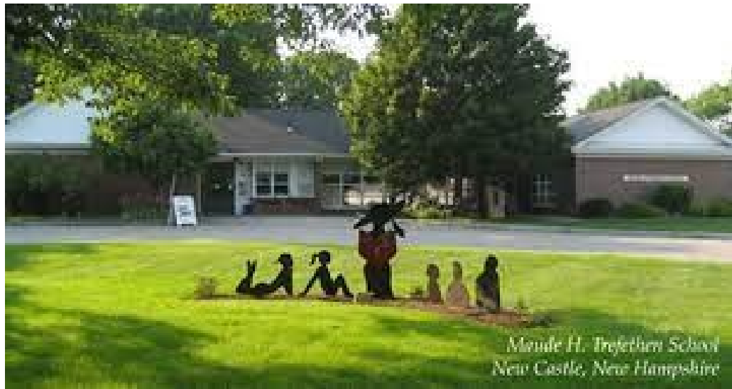
Maude H. Trefethen School New Castle, New Hampshire