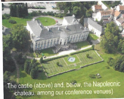
The castle (above) and, below, the Napoleonic chateau, among our conference venues)

Topics for the conference will include how we make best use of our culture, heritage, buildings and ecology to promote our Newcastles and our lifestyles as places for people to live, to work and to visit as tourists - the "Newcastle card", best practice, regional and twin city cooperation, opportunities for developing business between us all, managing and minimising waste. Also: managing change in our communities (Nové Hradý will discuss the transition to democracy) And especially for youth delegates - unemployment, barriers and prejudice, intergenerational divisions, exchange programmes. Finally - financing the future development of our alliance.