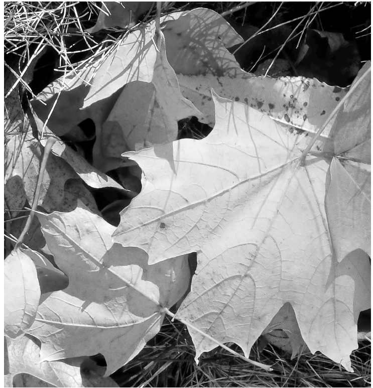
FALL LEAVES