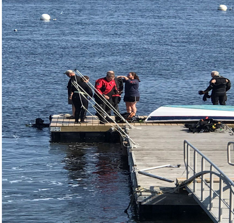
Divers preparing to enter the waters of Hart's Cove

The divers relocated the 50-foot sloop in Hart's cove and took wood samplings from the ship's timbers, which will date the construction of the boat, the type of wood, and the probable source of the wood. With the use of photogrammetry, they filmed the entire underwater project. This exciting project will be featured in a film, presented in a program by the NC Historical Society, sometime in the spring of 2024.